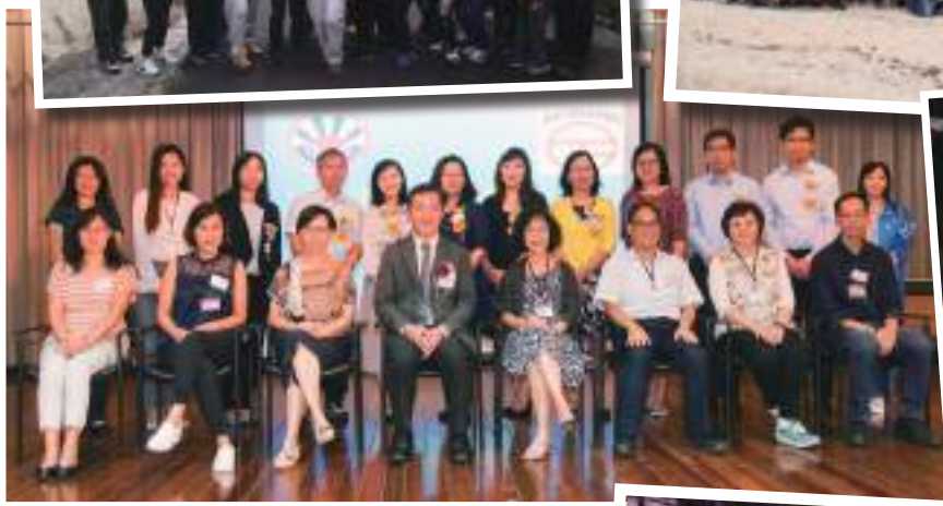
PTA Annual General Meeting