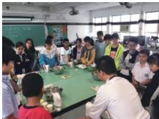
▲ Teaching children of ethnic minority to brew coffee