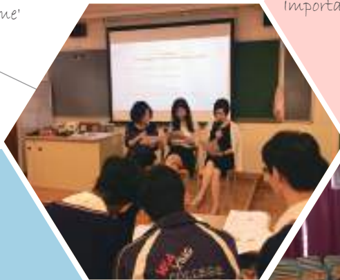
Mini-dramas on selected scenes of "The Importance of being Earnest"