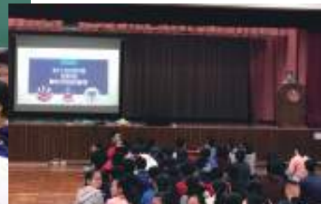
▲ Prefects’ Board: Joint-school Prefects’ Training Camp