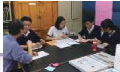
▲ Student Union: executive meeting

The Principal-led leadership training program had also fostered collaboration among student leaders of the four core teams and brought constructive insight over the refinement of the structure and functioning of the Student Council in the following year.