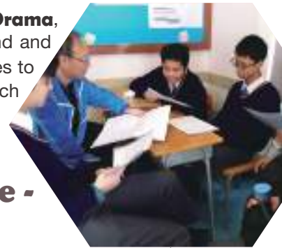
Working on the drama script

There were two Kaleidoscope classes offered: Kaleidoscope- through the Mirror of Drama , offering exposure to different drama experiences, like acting, backdrop designs, sound and visual stage effects; and Kaleidoscope- a myriad of colors , offering diverse exposures to sports, arts, technology and even K-pop. They could enable students to experience much wonder while exploring their interests and strengths.