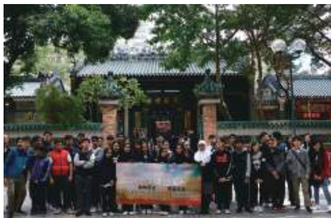
▲ Service for children of ethnic minority in understanding the local culture