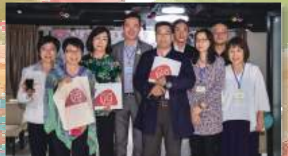
The commemorative album of Hang Seh: documenting stories of their classmate and teachers