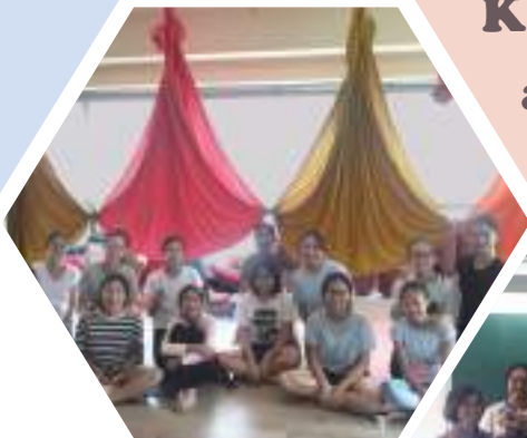
Ariel Yoga: stretching and flying