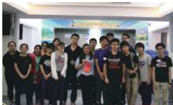
▲ Serving low-income families living in Kwun Tong, co-organised with Agency for Volunteer Service