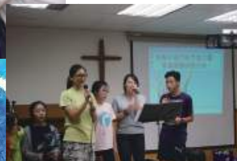
▲ Student Christian Fellowship: hymn-singing by praise-team