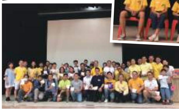
38 alumni joined the Alumni's career sharing session in Purpose Driven Camp