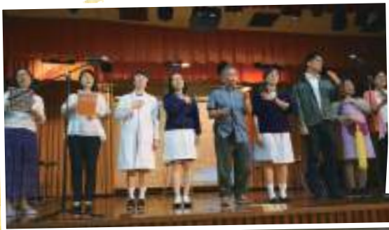
Respect Teachers' Day: parents dressed up as students in the role play