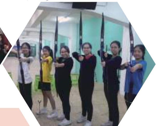
Archery: focusing on the target