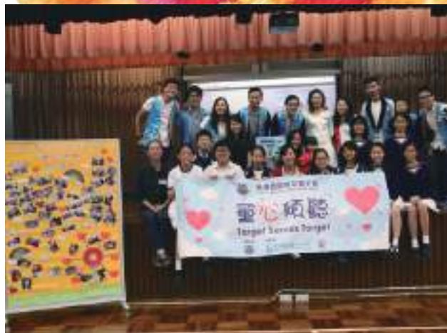
▲ Service program co-organized by 4C and Leo Clubs of Hong Kong West

Service Education is implemented in F.4 Life Education, so every F.4 student has to participate in at least one voluntary service. At the same time, a number of quality service programs are offered to students to learn and experience the meaning of service.