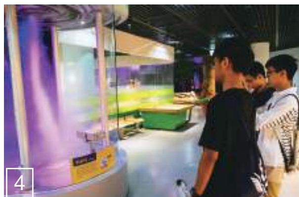
PHOTO 4: An artificial tornado in Seoul National Science Museum

PHOTO 3: Science demonstration in Samsung Innovation Museum