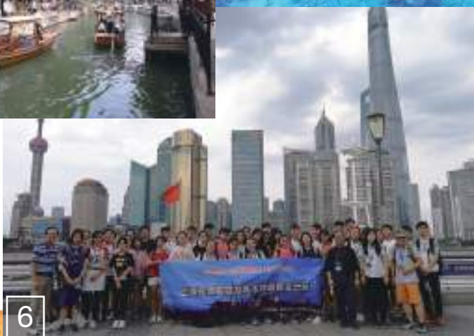
PHOTO 1: Our school volleyball team are in high spirit for the exchange program (Dec 2017) PHOTO 2: Precious learning opportunity with students of Daiyon Senior High School PHOTO 3: Learning the Japanese sportsmanship-discipline and devotion PHOTO 4: SAIC Volkswagen Automotive Plant, the modern mechanized industrial production plant PHOTO 5: Shanghai's Zhujiajiao Water Town, conservation of traditional culture PHOTO 6: The "World Architecture Exhibition Group" at Shanghai Bund, Shanghai's financial and trade center