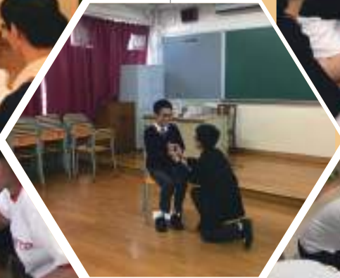
Mini-dramas on selected scenes of "The Importance of being Earnest"