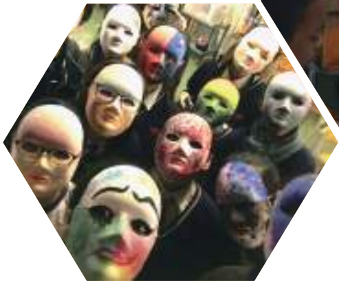
SELF: Emotion Pizza