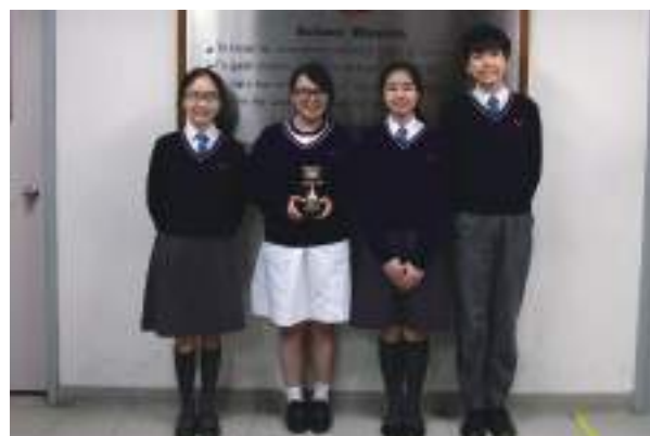
▲ Red Cross YU66 obtained the 3rd Prize in 2017-18 Nursing Competition