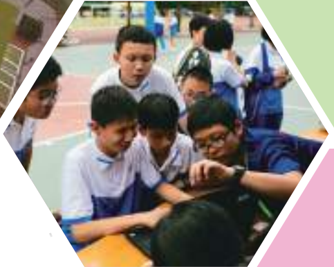
DIY Portable Game Console