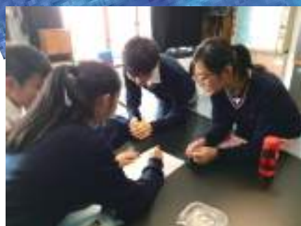
▲ Four Houses : Captains’ meeting