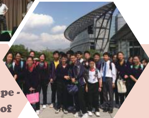
A "waste to energy" journey to T-park